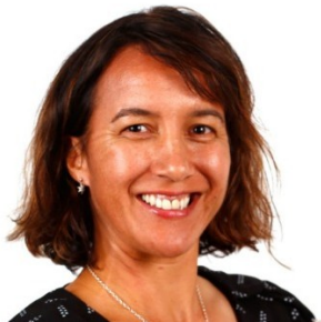
DR FARAH PALMER

commented: "It's very humbling to have the competition named in my honour. I had to have a real think about accepting it because rugby is a team sport and there are lots of women and men who have gone before me that really helped women's rugby develop. But then I thought it is a great honour and I am happy to be acknowledged